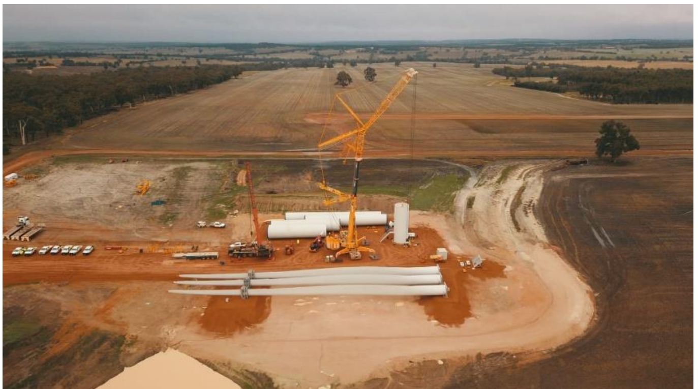
Installation of a tower underway at Flat Rocks Wind Farm Stage 1